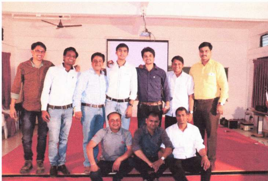
Alumni Meet 2016